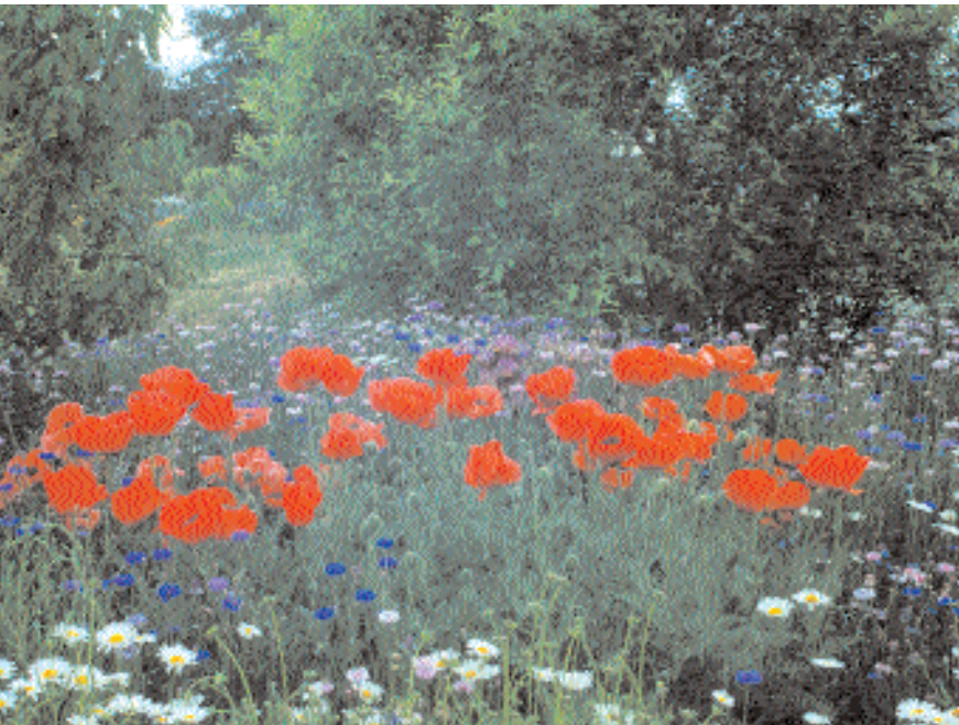
Oriental Poppies (Papaver orientale)

W ater-efficient landscaping techniques can be used by individuals, companies, state, tribal, and local governments, and businesses to physically enhance their properties, reduce long-term maintenance costs, and create environmentally conscious landscapes. The following examples illustrate how water-efficient landscapes can be used in various situations.