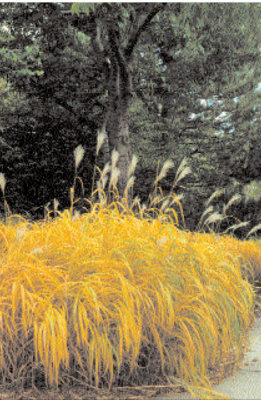
Miscanthus sinensis (Miscanthus grass, also called Maiden grass) variety with leaves turning yellow for fall.

Participants, including landscapers, property managers, and homeowner associations, can compare the actual cost of water used on their property with the calculated budget. Those staying within budget are awarded certification, a proven marketing tool. This new voluntary program is implemented by the Municipal Water District with input from the California Landscape Contractors’ Association, the Orange County Integrated Management Department, the Metropolitan Water District of Southern California, and local nurseries and has the support of 32 retailing water suppliers. The program is already credited with increasing the use of arid-climate shrubs and landscaping to accommodate drip irrigation, and has resulted in cost savings to water customers.