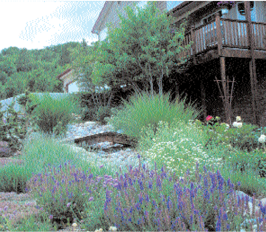
Xeriscaped front yard in Colorado Springs

Many terms and schools of thought have been used to describe approaches to water-efficient landscaping. Some examples include “water-wise,” “water-smart,” “low-water,” and “natural landscaping.” While each of these terms varies in philosophy and approach, they are all based on the same principles and are commonly used interchangeably. One of the first conceptual approaches developed to formalize these principles is known as “Xeriscape 3 landscaping.” Xeriscape landscaping is defined as “quality landscaping that conserves water and protects the environment.” The word “Xeriscape” was coined and copyrighted by