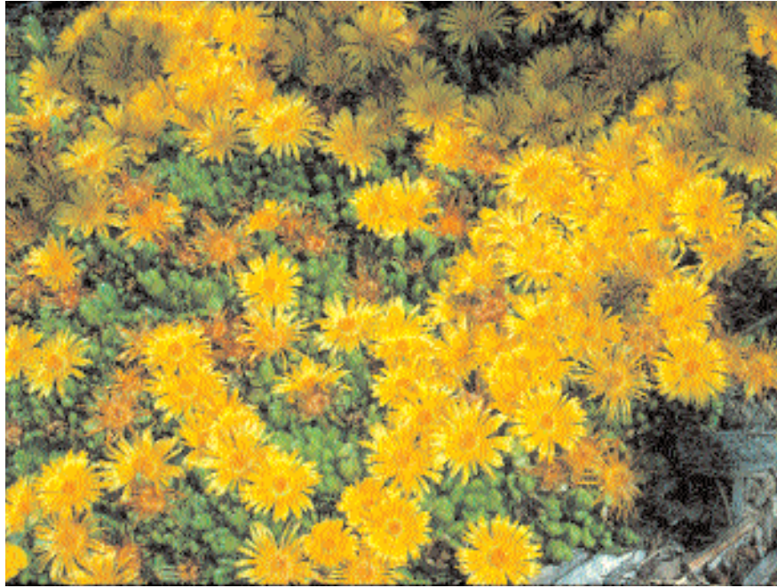
Yellow Ice Plant (Delosperma nubigenum) close-up

In Las Vegas, Nevada, homeowners can receive up to $1,000 for converting their lawn to Xeriscape, while commercial landowners can receive up to a $50,000 credit on their water bill. The city and several other surrounding communities hope these eye-catching figures will help Las Vegas meet its goal of saving 25 percent of the water it would otherwise have used by the year 2010; to date, it has saved 17 percent. Local officials plan to reach the target with the assistance of incentive programs encouraging Xeriscape, a city ordinance limiting turf to no more than 50 percent of new landscapes, grassroots information programs, and a landscape awards program specifically for Xeriscaped properties. Preliminary results of a five-year study show that residents who converted a portion of their lawns to Xeriscape reduced total water consumption by an average of 33 percent. The xeric vegetation required less than a quarter of the water typically used and one-third the maintenance (both in labor and expenditures) compared to traditional turf.