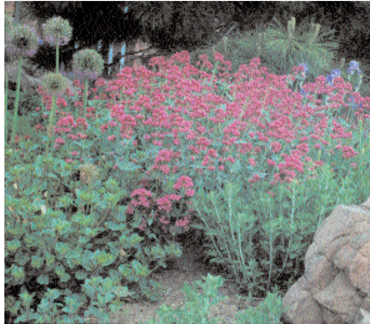
Red Valerian (Centranthus ruber)

To further reduce your water consumption, consider using alternative sources of irrigation water, such as gray water, reclaimed water, and collected rainwater. According to the AWWA Research Foundation, homes with access to alternative sources of irrigation reduce their water bills by as much as 25 percent. 4 Graywater is untreated household waste water from bathroom sinks, showers, bathtubs, and clothes washing machines. Graywater systems pipe this used water to a storage tank for later outdoor watering use. State and local graywater laws and policies vary, so you should investigate what qualifies as gray water and if any limitations or restrictions apply. Reclaimed water is waste water that has been treated to levels suitable for nonpotable uses. Check with local water officials to determine if it is available in your area. Collected rainwater is rainwater collected in cisterns, barrels, or storage tanks. Commercial rooftop collection systems are available, but simply diverting your downspout into a covered