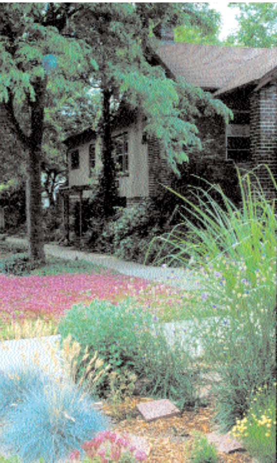
Dragon's Blood Sedum ( Sedum spurium ) under Honeylocust Trees ( Gleditsia triacanthos )

Landscaping that conserves water and protects the environment is not limited to arid landscapes with only rocks and cacti.