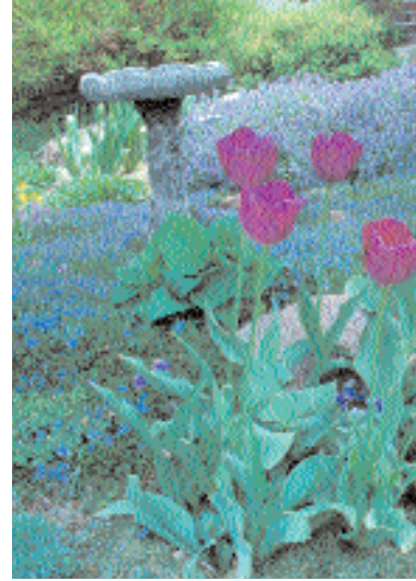
Turkish Speedwell (Veronica liwanensis) in background and tulips in foreground.