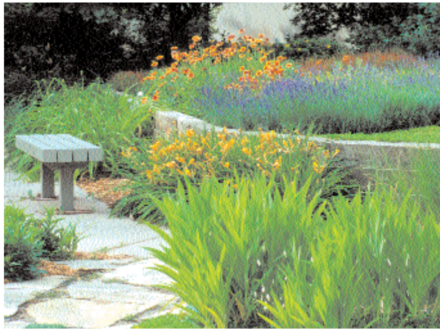
Xeriscape garden at Denver Water

This booklet describes the benefits of water-efficient landscaping. It includes several examples of successful projects and programs, as well as contacts, references, and a short bibliography. For specific information about how to best apply water-efficient landscaping principles to your geographical area, consult with your county