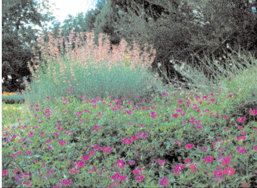
Wine Cup (Callirhoe involucrata) and Sunset Hyssop (Agastache rupestris) in the Denver Water Xeriscape Garden

Mulches aid in greater retention of water by minimizing evaporation, reducing weed growth, moderating soil temperatures, and preventing erosion. Organic mulches also improve the condition of your soil as they decompose. Mulches are typically composed of wood bark chips, wood grindings, pine straws, nut shells, small