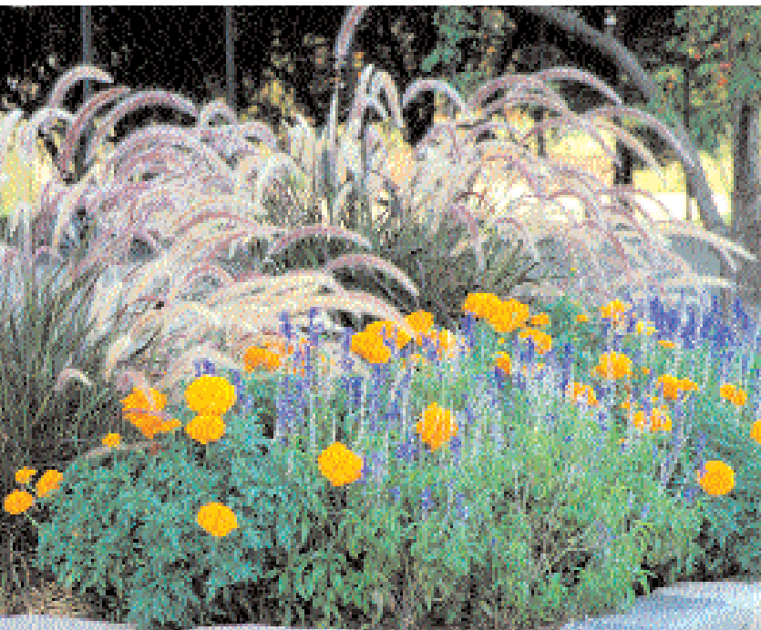
Purple Fountain Grass (Pennisetum setaceum "Rubrum") and Marigolds (Calendula officinalis) in planter bed

To make automatic irrigation systems more efficient, install system controllers such as rain sensors that prevent sprinkler systems from turning on during and immediately after rainfall, or soil moisture sensors that activate sprinklers only when soil moisture levels drop below pre-programmed levels. You can also use a weather-