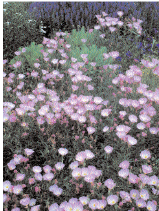
Meadow Sage (Salvia pratensis) is the background for New Mexico Evening Primrose (Oenothera berlandieri 'siskiyou')